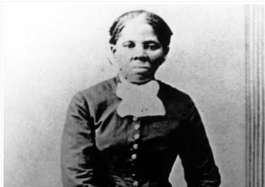
Harriet Tubman

Visit Buffalo-Niagara in New York state during February's Black History Month to learn more about the Underground Railroad, one of the most significant social movements in history, when blacks and whites worked together to actively oppose the federal laws that condoned slavery.